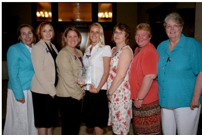
Haldimand-Norfolk Community Senior Support Services Inc.

In spite of the many challenges of serving a vast rural area, and delivering services with limited resources, the organization has maintained its commitment to serving the needs of a growing senior population.